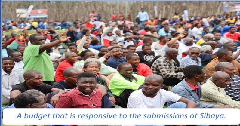
A budget that is responsive to the submissions at Sibaya.

Where the money comes from..... and where it goes